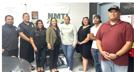
NMTech and Department of Labor