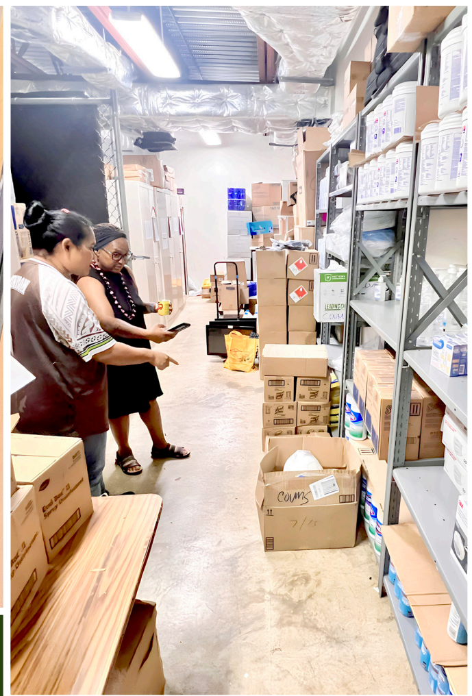
Inspecting Cha-Cha Oceanview Middle School's PPE's, a federal investment to ensure the health and safety of public school students.