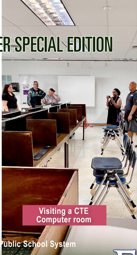
Visiting a CTE Computer room