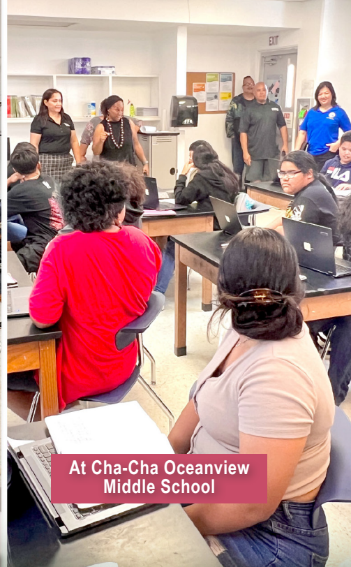
At Cha-Cha Oceanview Middle School