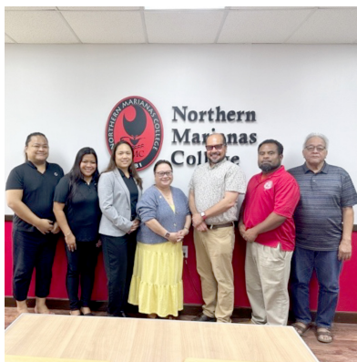
Northern Marianas College and Adult Business Education