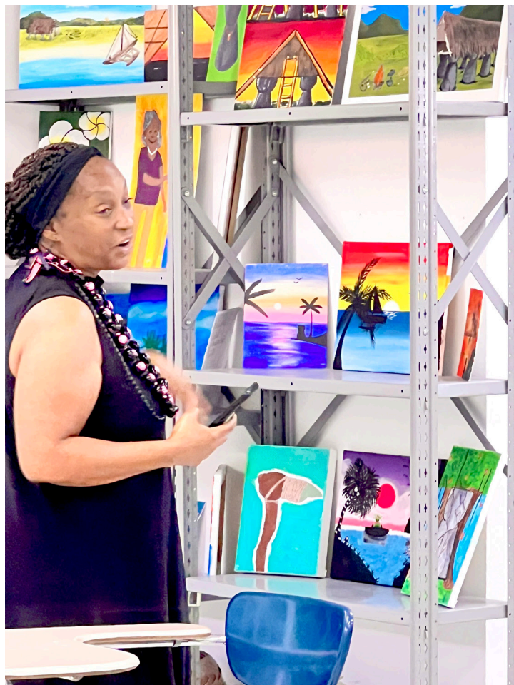
Praising the artwork of Cha-Cha Middle School students.

“I do have confidence in the folks now in their respective positions. Especially strong federal programs office, and finance, and procurement and internal auditor,” she said.