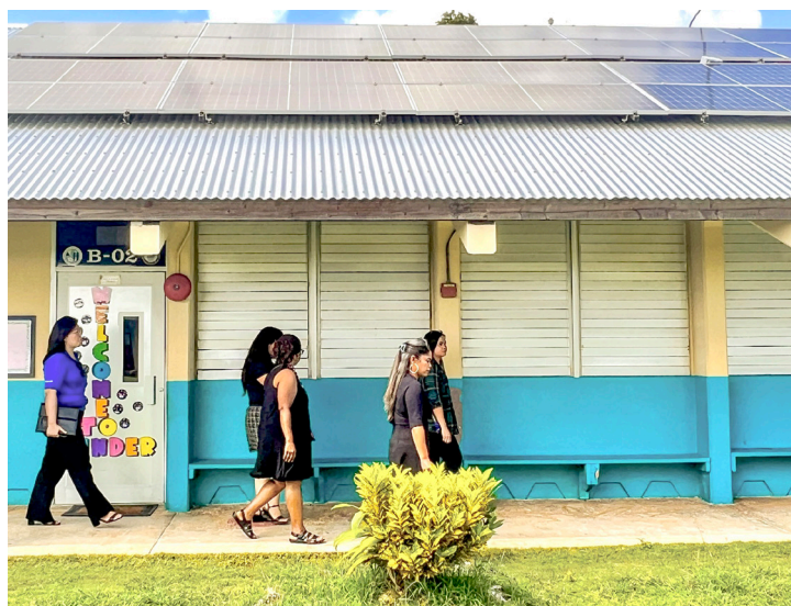
Inspecting the solar panels and classroom investments at Oleai Elementary School.