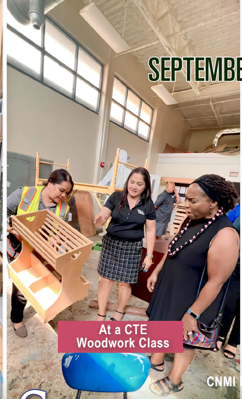
At a CTE Woodwork Class