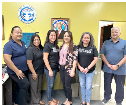
CNMI Scholarship Office