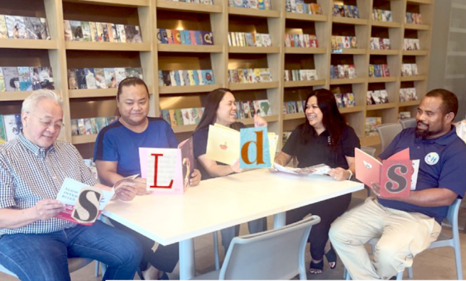
CNMI SLDS team taking a break from countless hours of grant writing.