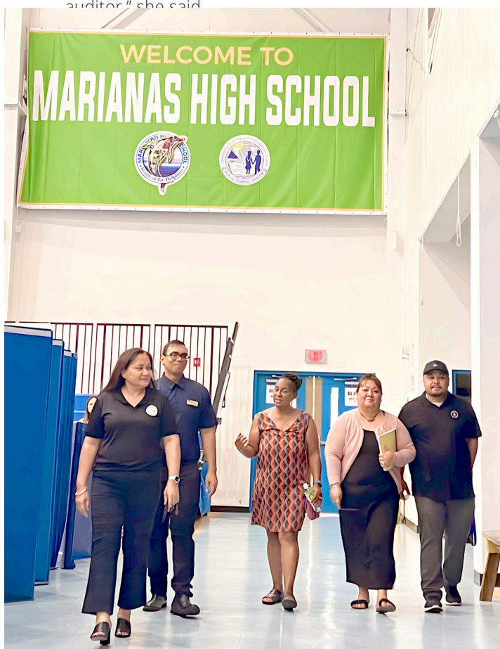
Inspecting the Marianas High School Gymnasium.