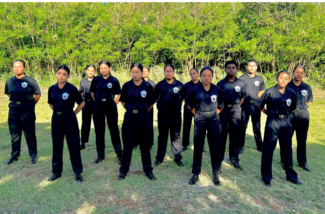
Third place winner in the unarmed regulation is the Tinian Junior High School Leadership Corps team.

Launched in 2009, the Public School System was the first in the Pacific region to initiate a middle school leadership program. The school district's middle leadership corps program is tailored to the nationally-recognized National Leadership Corps Interactive Curriculum, among others.