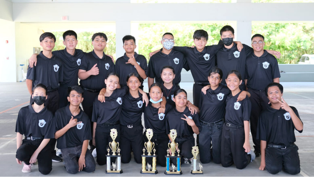
Second place winner, the Leadership Corps team of Hopwood Middle School.