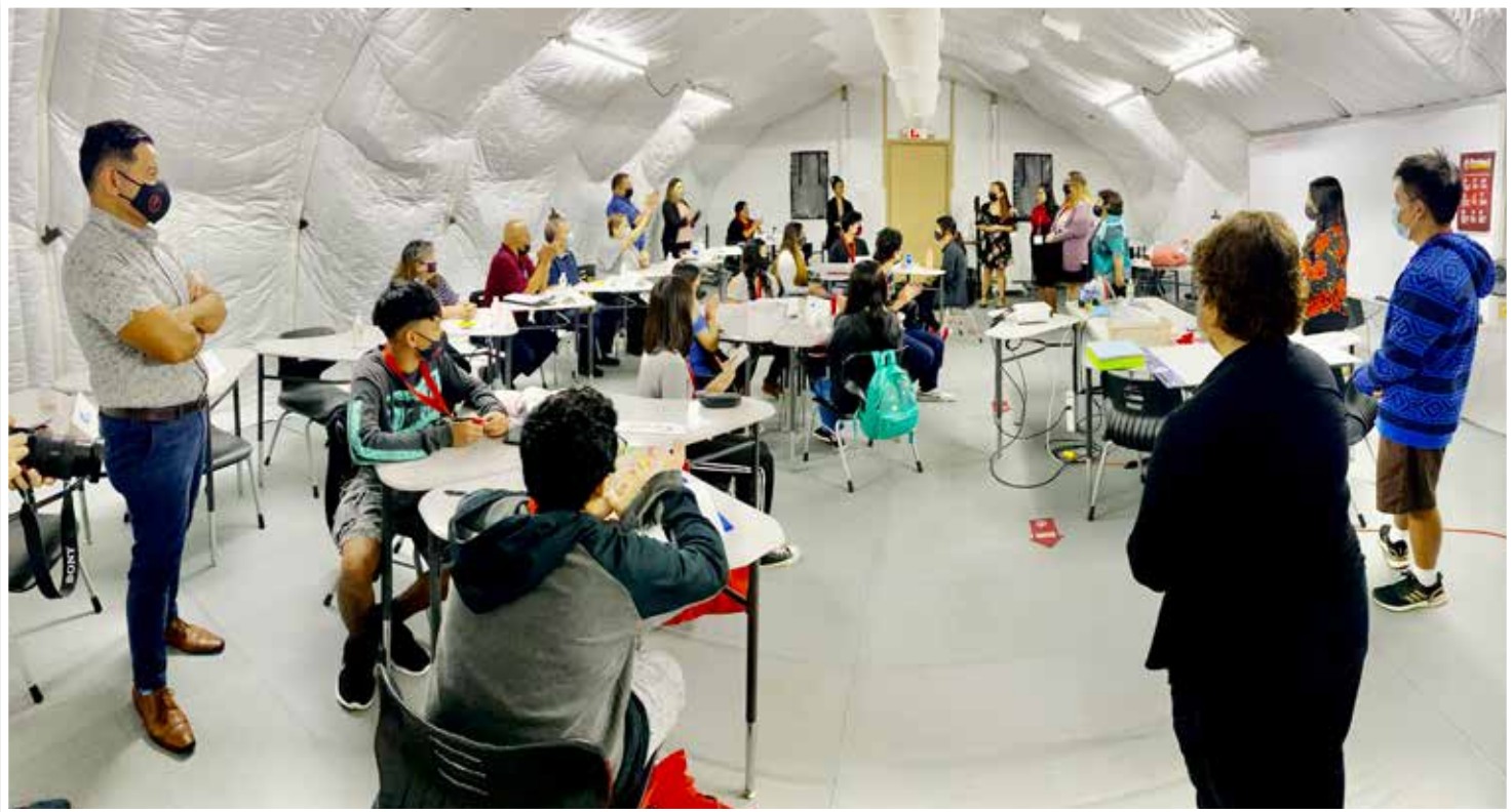
The actual classroom set up of the Teacher Academy Summer Program.