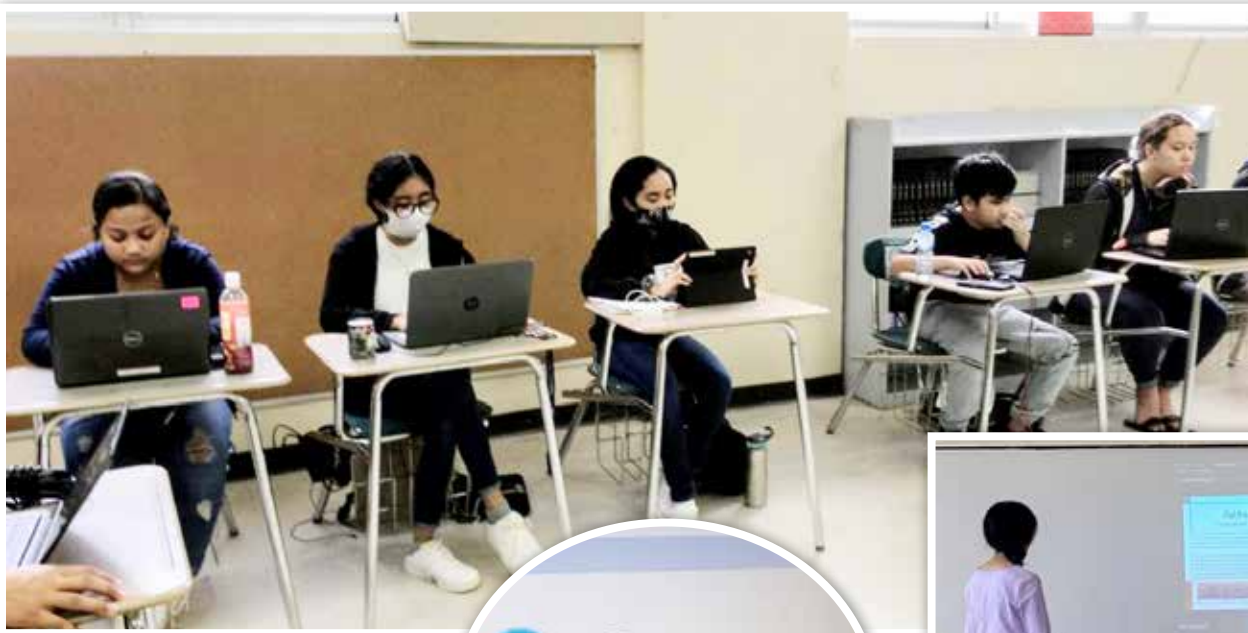
These students are taking their NMC class online daily and at 12 noon, they will work on their sales pitch.