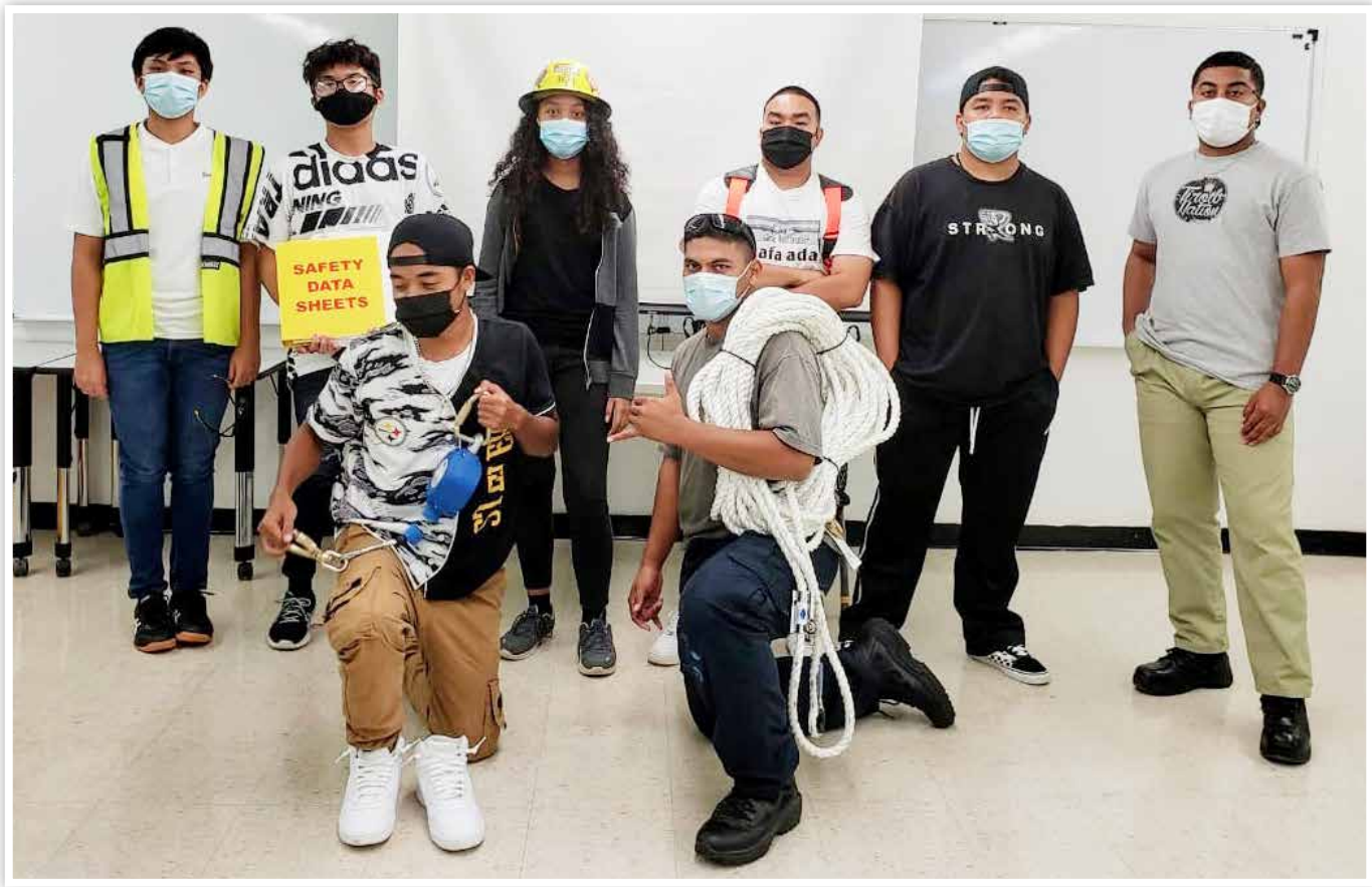
The students gather for a photo following their successful completion of the rigorous two-day OSHA training.