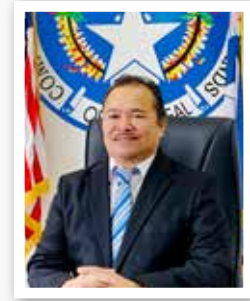
BY ALFRED B. ADA, ED.D. COMMISSIONER OF EDUCATION

Let's Re-imagine, Re-engage & Re-open 'This is an exciting time to be in education'