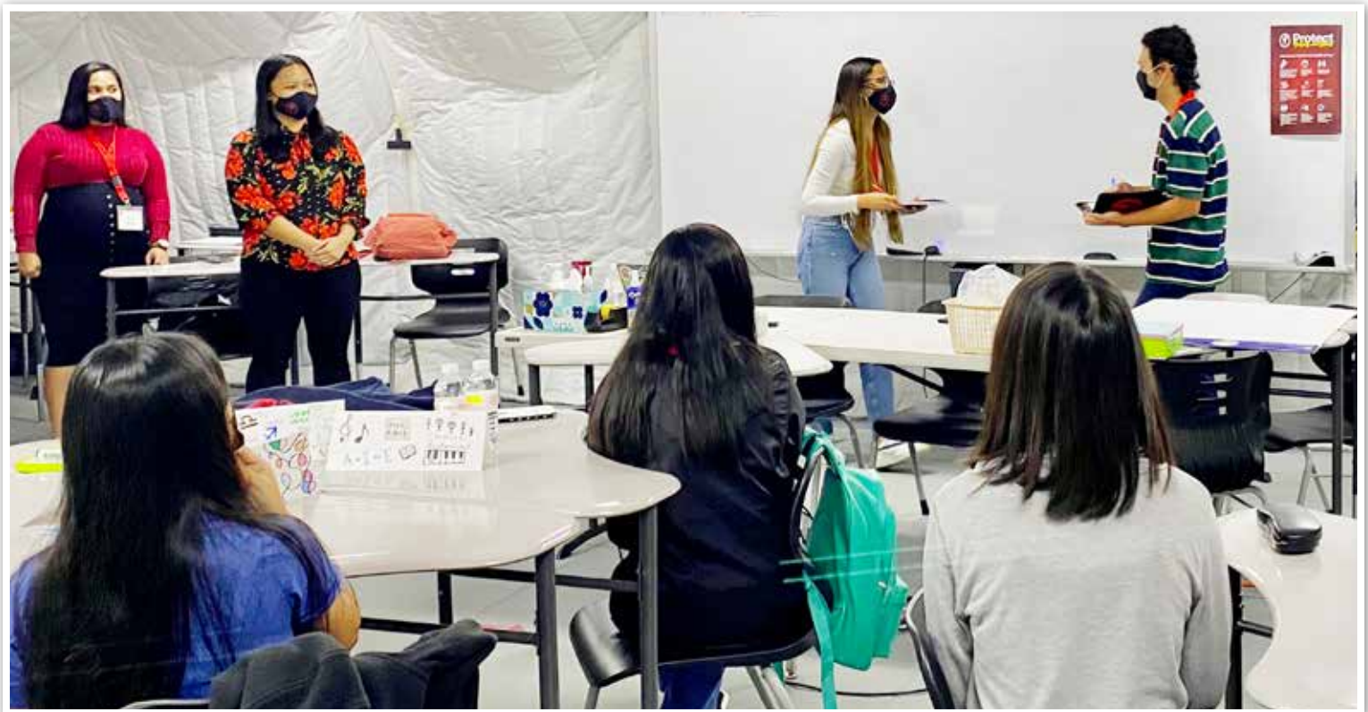
A group activity engages students in "multiple intelligence" activity.