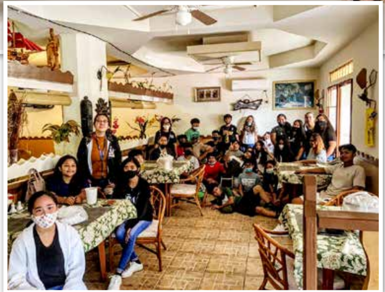
The students were provided with a budget to eat at As Paris, one of Rota's go-to places. They rated the quality of the customer service, portion size, cleanliness, presentation of food, and customer satisfaction.

D r. Rita H. Inos Junior Senior High School has unveiled a "Four-Year Entrepreneurship Pathway" to help create/build entrepreneurship and business careers for Rota's youths.