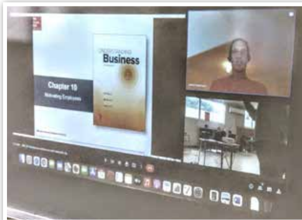
Virtual learning with Northern Marianas College.