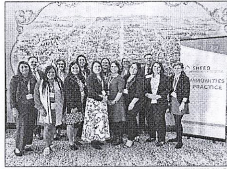
Staff members from the Virginia and Colorado offices of State Higher Education Executive Officers share a moment with the CNMI state team during their visit to Washington, D.C. The CNMI team had traveled the longest distance among all state teams, spending approximately 36 hours in transit.

The CNMI's application to SHEEO's Community of Practice is driven by a clear purpose: to engage in a collective effort aimed at enhancing our data initiatives, understanding that continuous improvement is paramount to our success — specifically aimed to harness the resources and expertise available through this community to address critical areas of development within the CNMI's