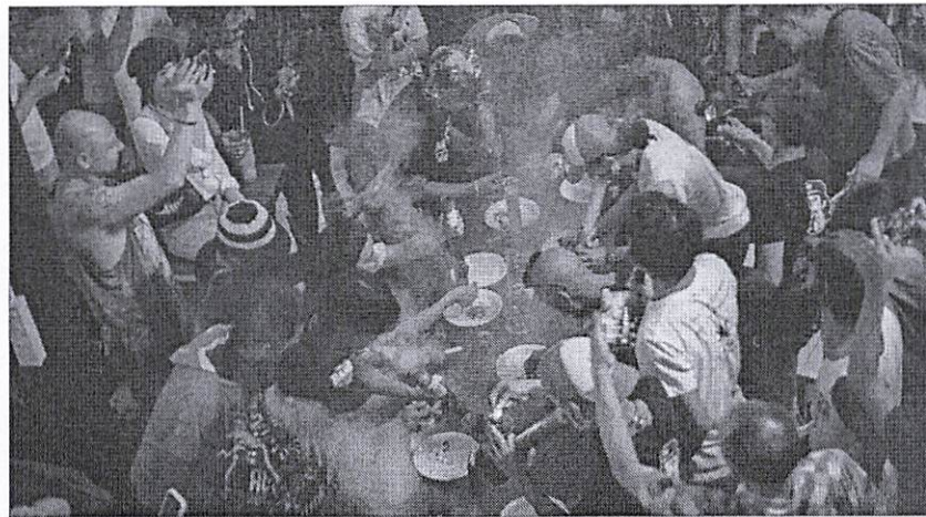
People smoke out of bongs during a speed contest to finish 3 grams at the Green Party in Bangkok, Thailand, Oct. 7, 2023.

The Health Minister Cholnan Srikaew, in an interview with Reuters last month, described