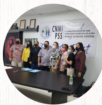
PSS and NMTI sign dual credit MOA