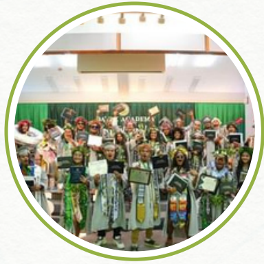
Da'ok Academy 2023 Graduation Ceremony