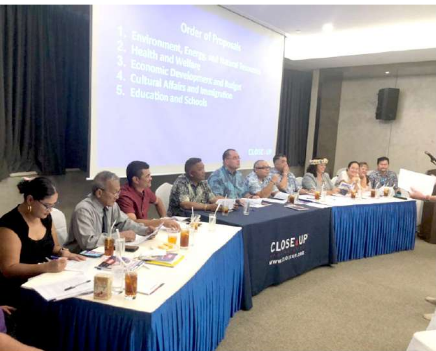
Members of the CNMI Legislature sit together as they listen to proposals made by the students.

FROM October 23-27, students from all over the CNMI came together to participate in the 2022 Close-Up Youth Summit at the Saipan World Resort. The Close Up Youth Summit is an opportunity for students to research local problems and brainstorm solutions affecting our community. They also got a close-up opportunity to meet and discuss their thoughts with professionals and lawmakers who work daily to battle the same issues.