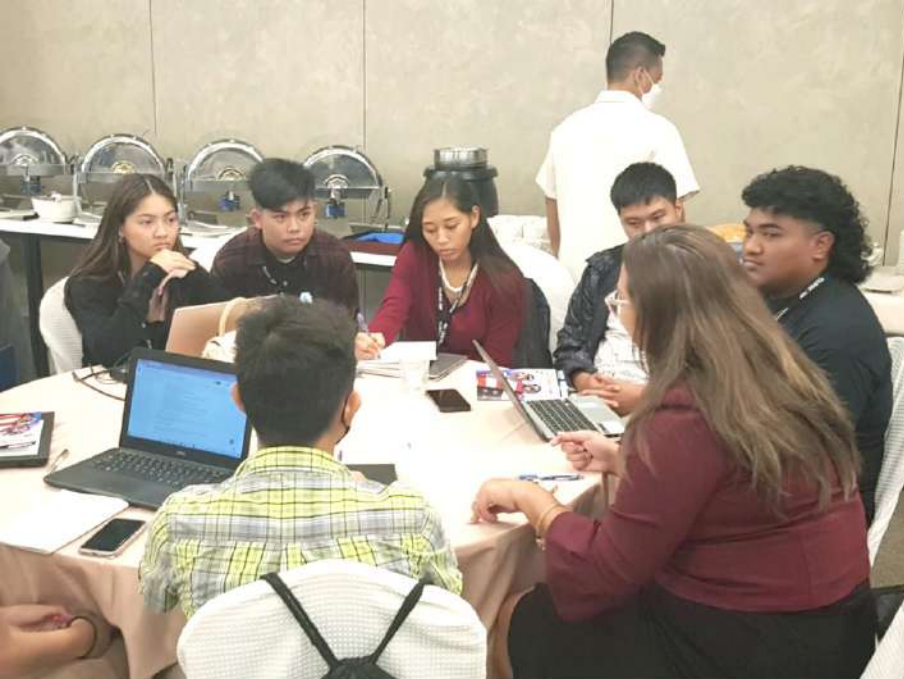
Students present their proposal to members of the CNMI Legislature.

they chose, and began writing their own proposals to address the problem. Instructors gave them guidance on how to write their drafts, and the students engaged in discussions over their chosen issue. They were also able to get insights from experts from different Departments and Organizations in drafting their proposals, as well as U.S. Congressman Kilili Sablan.