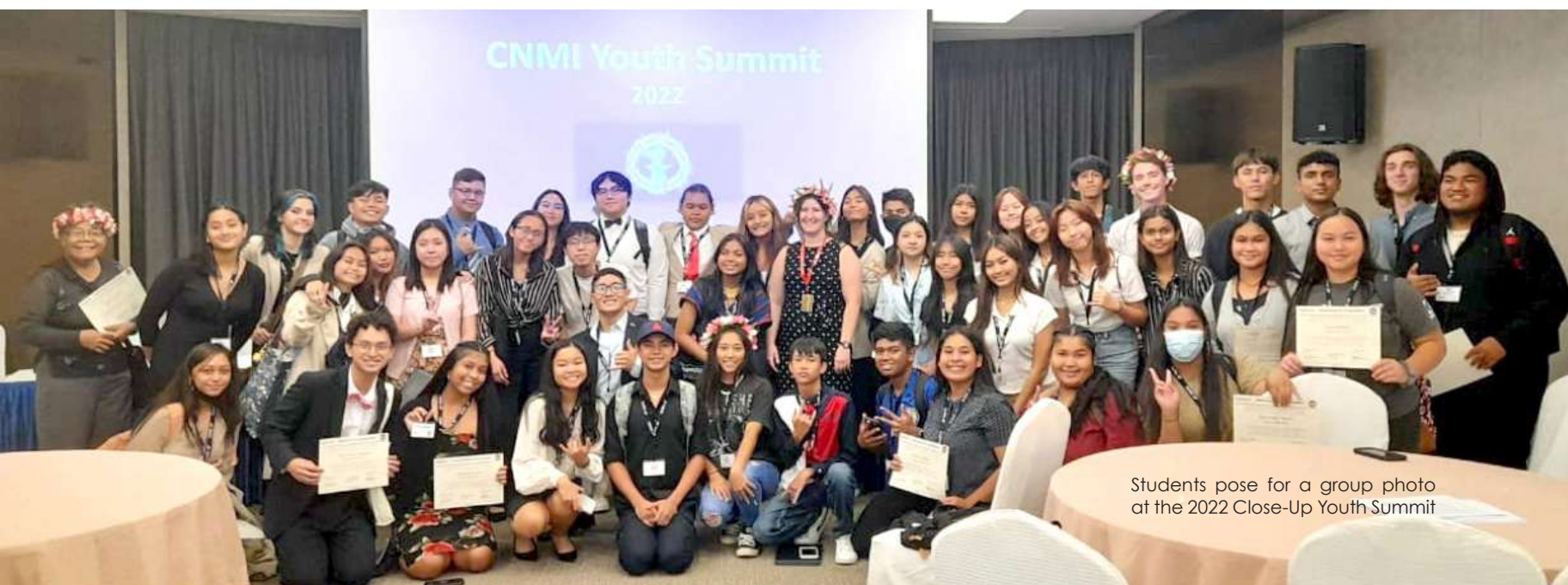
Students pose for a group photo at the 2022 Close-Up Youth Summit