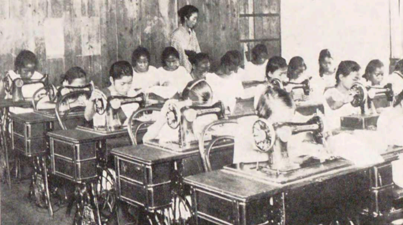
Sewing class in Saipan circa 1932.