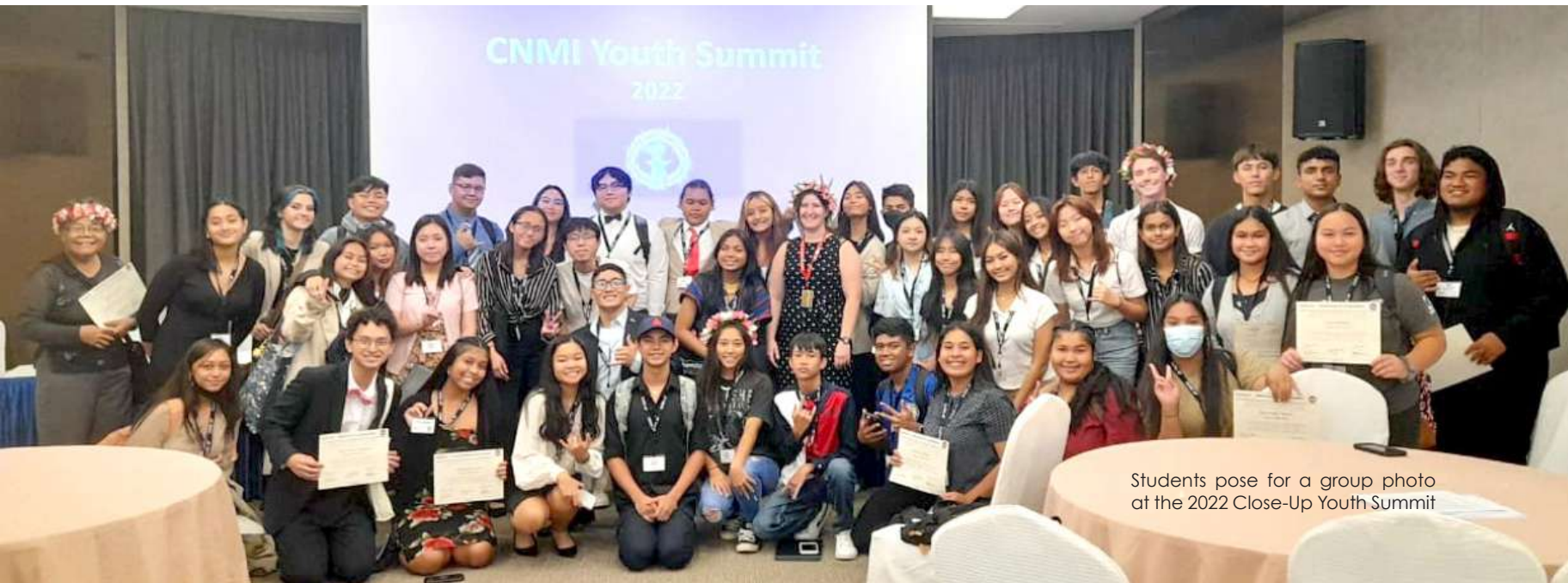
Students pose for a group photo at the 2022 Close-Up Youth Summit