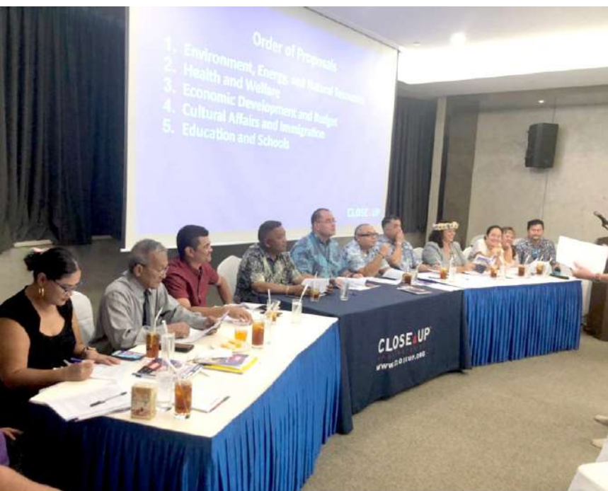
Members of the CNMI Legislature sit together as they listen to proposals made by the students.

FROM October 23-27, students from all over the CNMI came together to participate in the 2022 Close-Up Youth Summit at the Saipan World Resort. The Close Up Youth Summit is an opportunity for students to research local problems and brainstorm solutions affecting our community. They also got a close-up opportunity to meet and discuss their thoughts with professionals and lawmakers who work daily to battle the same issues.